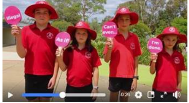
( https://www.youtube.com/watch?v=H6B6PPgOC8I )

Parents are welcome to visit the Narrabundah College front office or call on 61423200 to make enquiries regarding their sons & daughters. Please do not walk around the college looking to make contact with staff.