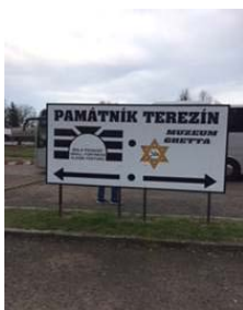
Terezin Concentration camp