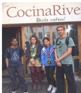
Cooking for the homeless