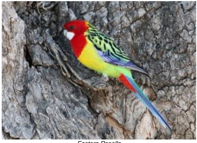
Eastern Rosella